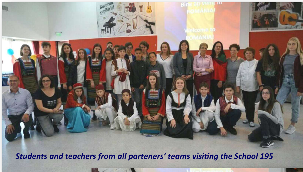
Students and teachers from all partners' teams visiting the School 195

In October 2019 all school -partners' teams- 20 students and their teachers worked in our school, as part of the collaboration for the Erasmus + program on the multi-facet